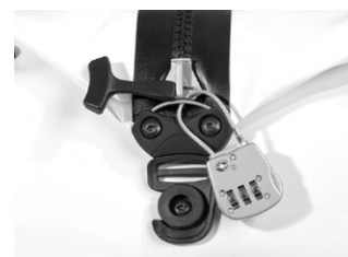
Wire loop for locking the bag with padlock (padlock not included)

Editor's Choice for Duffle RS 110, German outdoor magazine, 3/2015