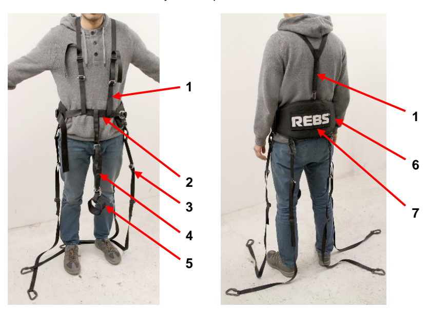
Figure 1: Part overview

The harness is an assembly of straps, buckles and carabiners.